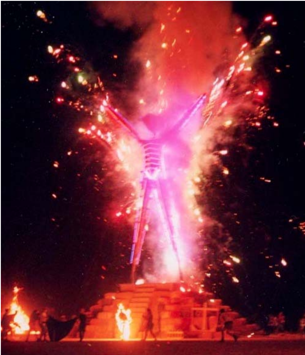
Two Burning Men — Burning Man is lit by an asbestos-covered burning human, who runs up to the leg of the wooden man lights the fuse with his burning arm, and runs down again (the flame in the center of the picture). Fireman run with blankets to cover the burning man while the Burning Man erupts in flame and fireworks.