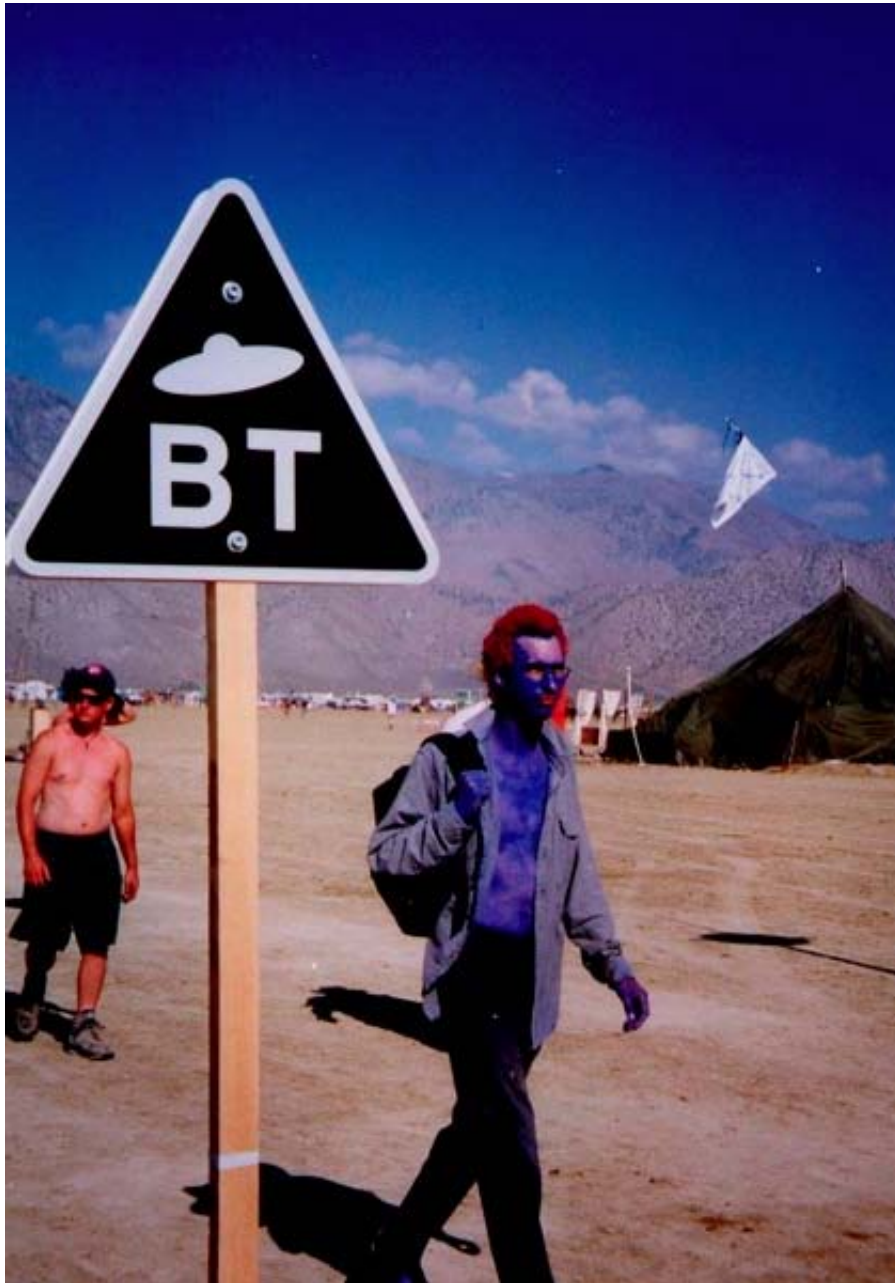
BT sign – In 1998 mysterious signs appeared throughout the city along the emergent roads and at intersections. This one was clearly warning of BTs ahead.