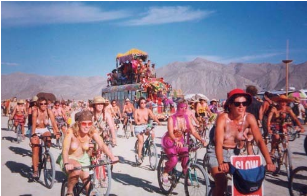
Girls — Tits on Bikes, they call it. It's a girl thing. The ladies take off their tops, encourage other girls to do the same, and then parade in a great circle around Burning Man while whooping it up big time.