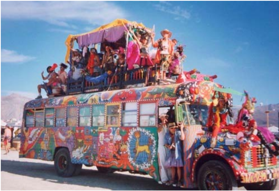
Magic Bus – This painted school bus puts Ken Kesey’s old hippy bus “Further” to shame. It’s got more colors, more weirdness, more levels, more people hanging on, and in every way looks like more fun.