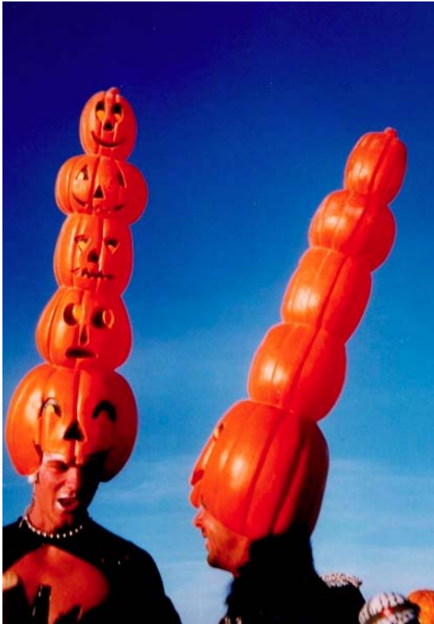
Pumpkin heads – On the eve of day before the Burning of the Man there is a costume party and fashion show, and the assignment seems to be to outdo everyone in sheer exuberance. If you've got something, flaunt it. The more alien, unearthly, and over-the-top, the better.