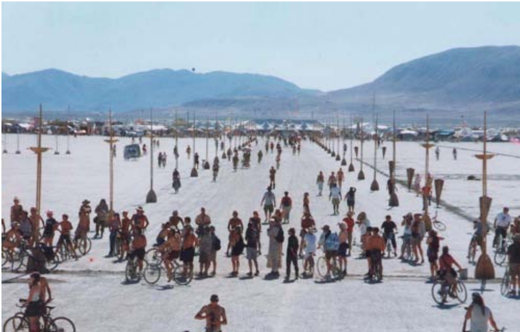
Street – The main boulevard from the central camp to the Burning Man platform. Cars are banned from driving within the city limits so the city of 23,000 residents has become one of the largest pedestrians and bicycle cities alive.