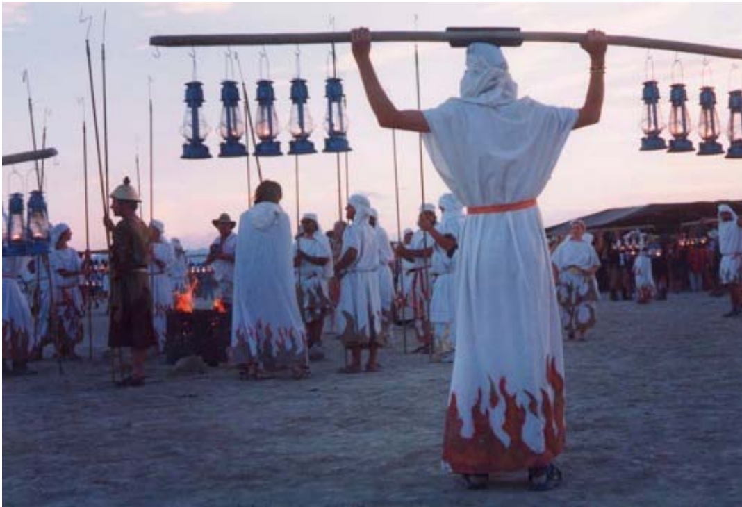
Lanterns – Every evening at dusk, volunteer “fire people” put on their robes, perform a fire-lighting ceremony, and then carry a yoke of kerosene lanterns to place on lamp stands along the radiating streets.