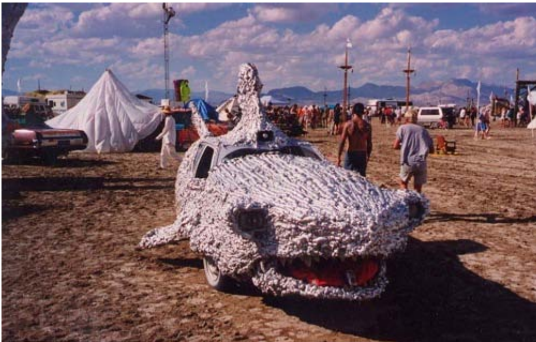
Shark Car – The Burning Man weekend doubles as an art car rendezvous. This one is a classic art-car of painted foam. It cruises the desert slowly.