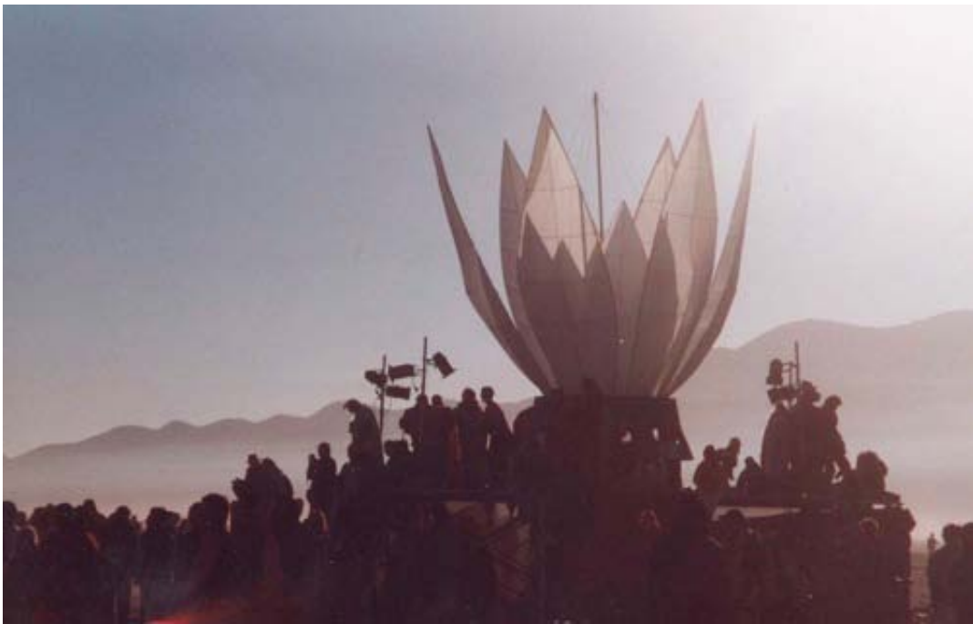
Sail Flower Thing – I have no idea what this thing is supposed to be. It was in the middle of a pile of sound equipment at a rave station. The rave music is extremely loud (you can hear it at least five miles away in the desert) and plays all night long, and turns off promptly at sunrise in the morning.