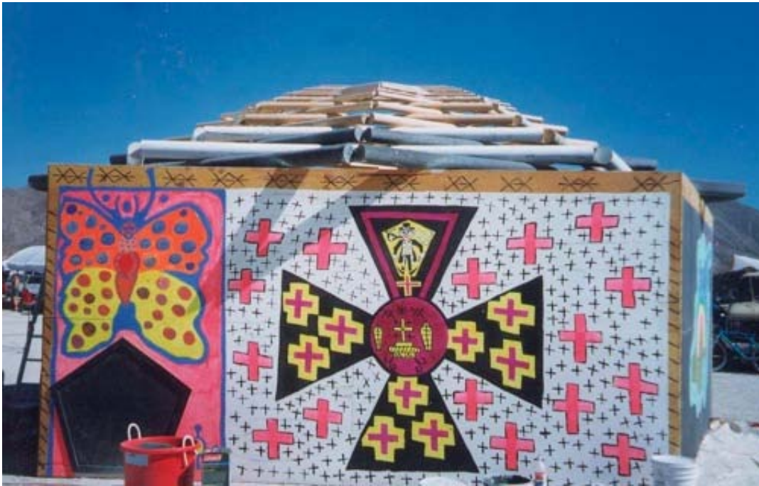
Painted Hut – Burning Man has evolved its own graphic folk style: clean, bold, full of bright colors, optimism, mechanical rather than organic and deeply alien.