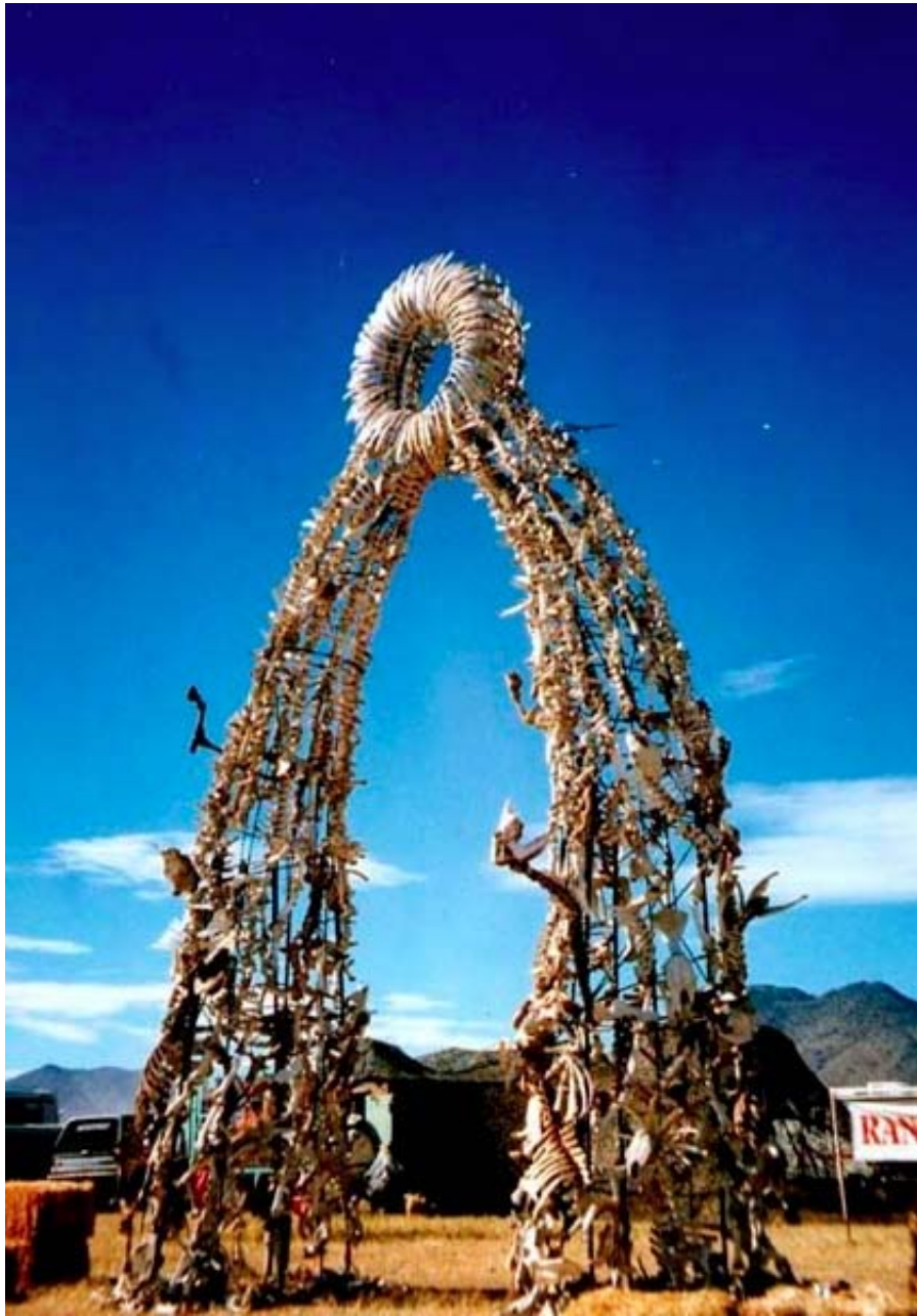
Bone Arch – Hundreds of bleached animal skeletons and skulls (most cows) were wired together into a gothic arch near the center circle of the city.